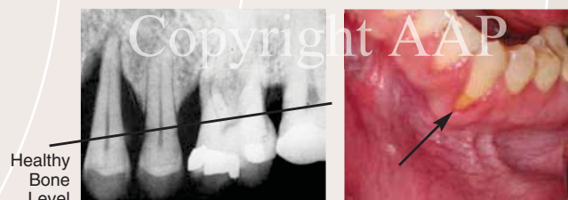
Figure 1 Black area above line indicates bone loss

The detection of periodontal diseases is often more difficult in tobacco users. This is because the nicotine and other chemicals found in tobacco hide the symptoms commonly associated with periodontal diseases, such as bleeding gums. Since the detection of periodontal diseases in tobacco users can be difficult, necessary treatment is sometimes delayed.