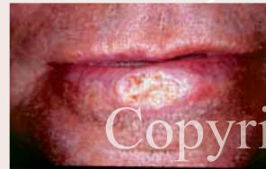
Figure 3 Lip cancer

The actual treatment of periodontal diseases can vary widely depending on how far the disease has progressed. In fact, if caught in the early stages, simple non-surgical periodontal therapy, such as scaling and root planing, can be done. If the disease has advanced to the point where the periodontal pockets are deep and bone is lost, surgical therapy may be necessary.